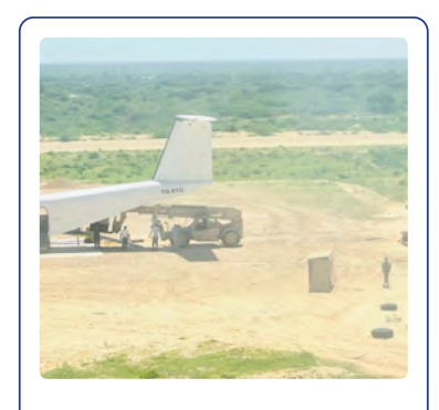
Remote Location Operations