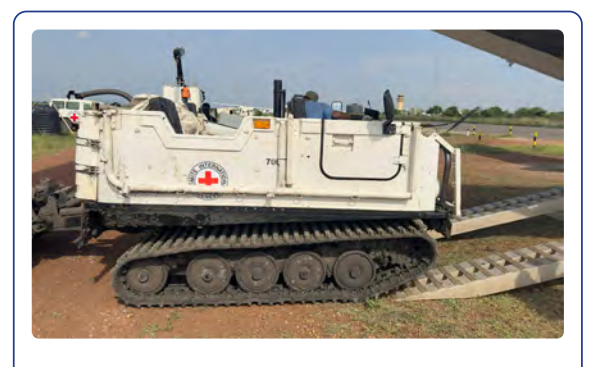
Vehicle Loading Process