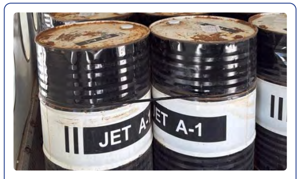
Fuel Transfer Operation