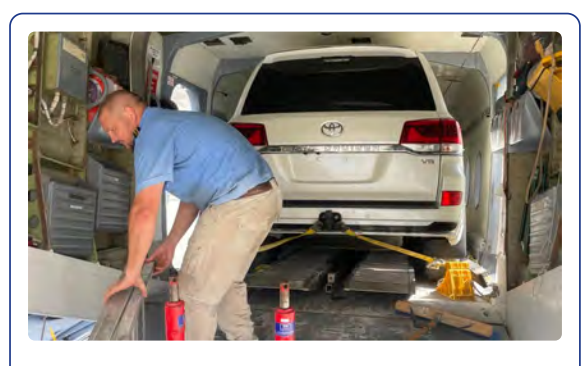
Secured Vehicle Transport