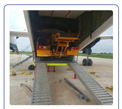
Rear Loading Door