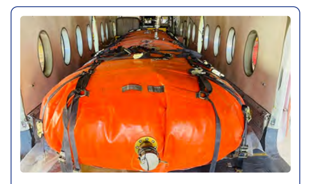
Fuel BATT Tank photo