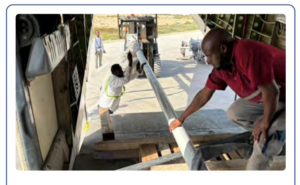
Steel Poles Transport